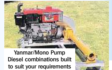
Yanmar/Mono Pump Diesel combinations built to suit your requirements

Valley Pumps Sell and service the complete range of MONO and GRUNDFOS solar systems, we can design a system to suit whatever your requirements are. High head and whole farm watering is easily achievable. Solar powered water pumping systems have been developed by Mono Pumps to pump water from boreholes, wells, lakes or rivers where electric or diesel power is unavailable or unreliable. Reliability is the corner stone of a Mono Pumps Solar system as they are designed to operate without any human interference in the remotest parts of the world. A Mono Solar Pumping system can run for years without maintenance.